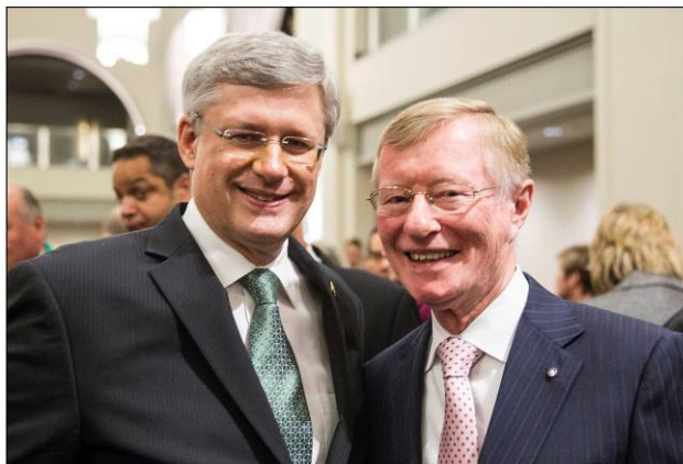
Office of the Prime Minister Cabinet de Premier ministre